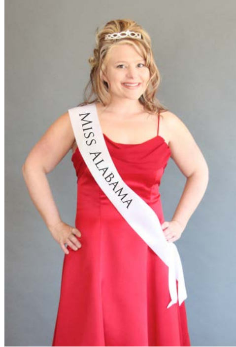
Sash made with 5" ribbon