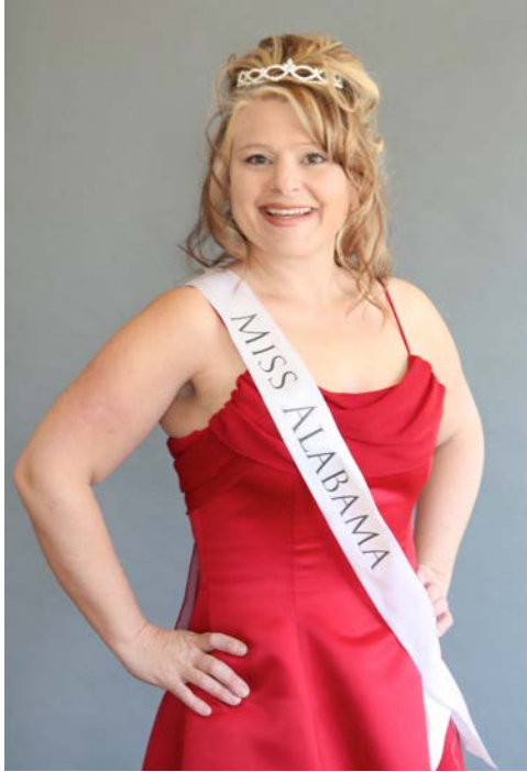
Sash made with 2.5" ribbon